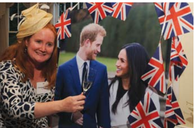
A guest raises a toast to the Royal Couple.