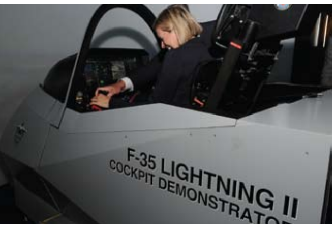
Taking flight? A guest tries out the Cockpit Demonstrator at the LM Fighter Demo Center.