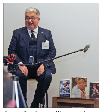
Page 6 – Bestselling author discusses the Royals and Brand Messaging