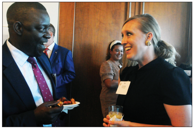
Members and guests enjoy the networking reception following the AGM