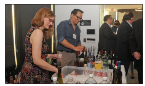
Plenty of food and refreshments for all!