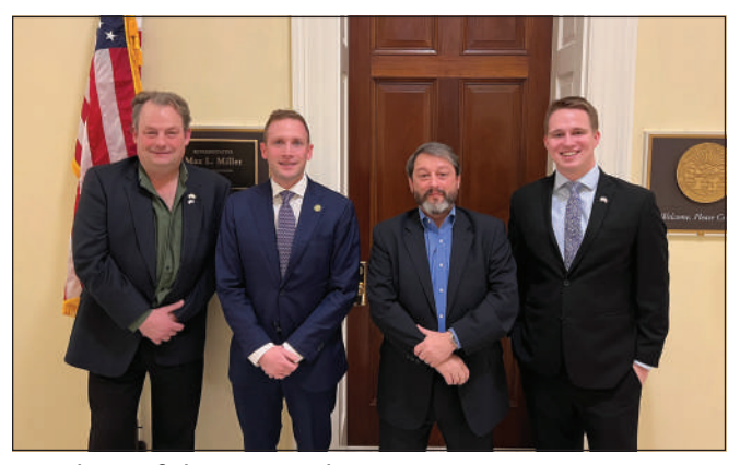
Members of the BABC- Ohio