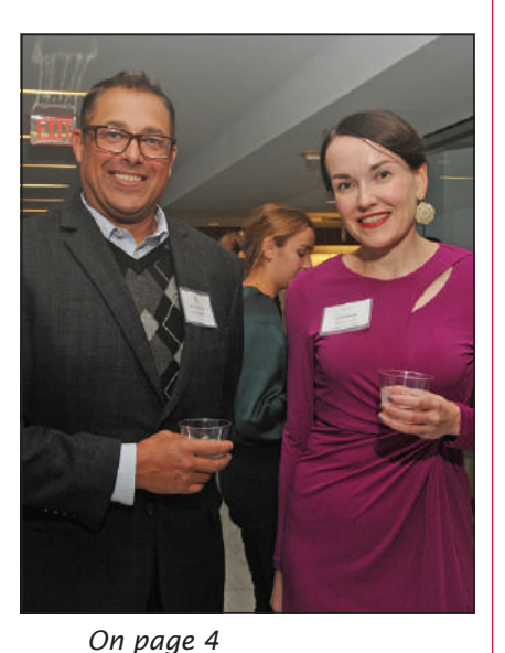
International Rooftop Networking