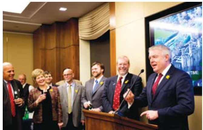
First Minister of Wales Carwyn Jones (at podium).

While in Washington the First Minister attended a special St David's Day reception on Capitol Hill with the Friends of Wales Caucus, a group of US Congressmen who help to promote Welsh business and cultural links between Wales and the USA.