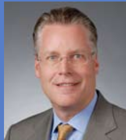
Ed Bastian President Delta Air Lines